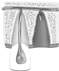
KNOCKED OUT TOOTH